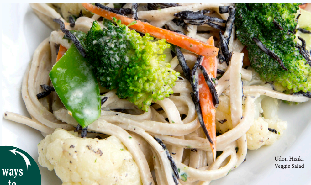
Udon Hiziki Veggie Salad