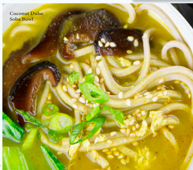
Coconut Dulse Soba Bowl

Fresh milled North American organic family grain for wonderful taste. Crafted solely using traditional methods. The flour is kneaded with pure water and a bit of EDEN Sea Salt that binds the dough and enhances its taste.