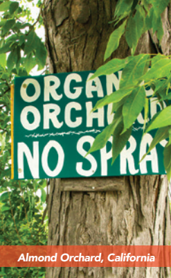
Almond Orchard, California