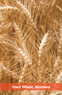
Hard Wheat, Montana