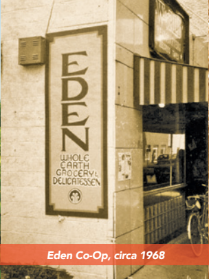
Eden Co-Op, circa 1968