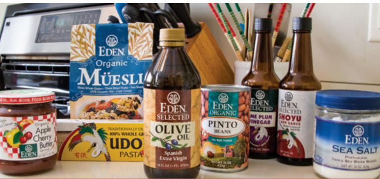
Eden Foods Test Kitchen in its Marketing Department

All of the recipes herein were tested and enjoyed in Eden kitchens and homes.