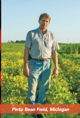
Pinto Bean Field, Michigan