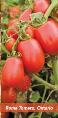
Roma Tomato, Ontario

The EDEN food brand is more than 400 items that make healthy cooking and eating a joy. All foods are procured and prepared with our children and grandchildren in mind. They eat them. Purity is paramount and maintained through painstaking focus and long-nurtured relationships with the growers who provide them to us.